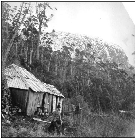
Henry Woods at the Springs in winter 1880

Another day I scrambled up the staircase of fallen trees and tree fern trunks by the bed of a half dry stream for 1500' [feet] till we reached the first ridge of the mountain where an old convict and his wife lived summer and winter by boiling tea-kettles for visitors. 27