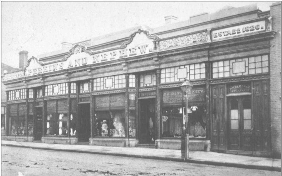
Perkins and Nephew, corner Watchorn and Liverpool Streets.