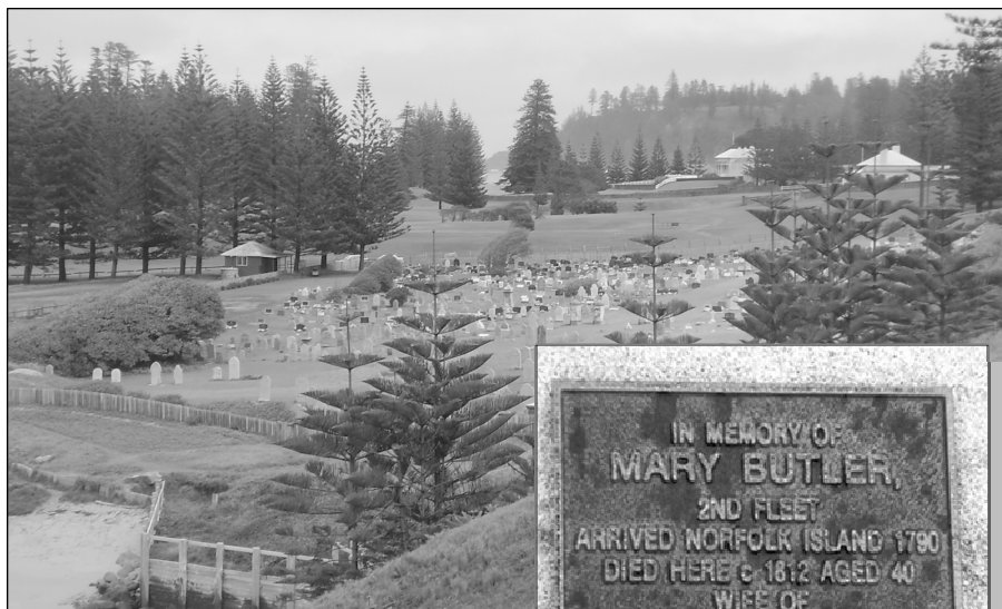
Norfolk Island Cemetery 2006