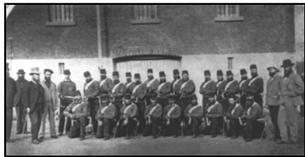
Tasmanian Territorial Police, c. 1873