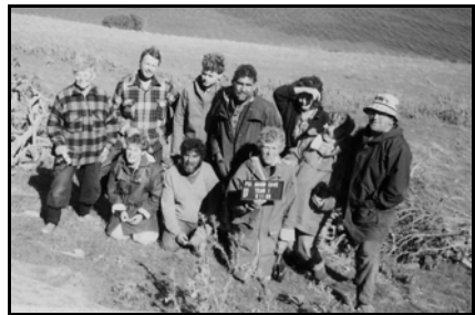
Tired, dirty, but happy gang on our last day

When I arrived back on Flinders my friend put me to bed for a week, and told me I was very lucky as she remembered her mother telling of a child who died from being stung with what is known on the island as Man Nettles. ●