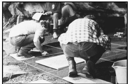
Digging in the cave

Our island dig continued and all the inconveniences were forgotten during the day as we took our turn of digging, carrying sand, sifting and cataloging. From our advantage spot on the top of