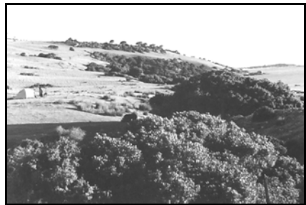
Cave, top left behind Rob's tent

Soon we found we were short of water and from then on had to be very careful with it. The hardest was washing ourselves in salt water in our tents. Sitting on my bed with a bowl of salt water was no fun. To have fresh water for our tea and coffee Ron would walk a couple of miles down to an old tank at an abandoned house and fill up one of our containers every couple of days.