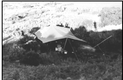
Cooking tent with a thistle garden

When at last we arrived at our destination we had to first pile into a rubber ducky with all our gear, tents, bedding and personal bags, and row to the rocky outcrop, from where we had to haul our gear up onto the cliff-top. By this time I was wondering if I had been foolish at my age (I was later to find out I was the oldest) to volunteer. But by the time we had our tents up and viewed the beautiful scenery I had forgotten my worries.