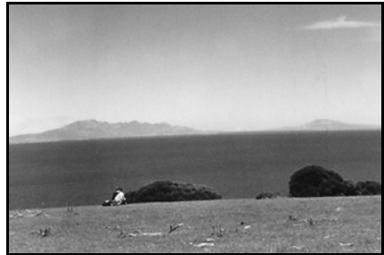
Flinders's Island from Prime Seal Island

So between the nettles, spiders, snakes, blowflies and the blown meat, this was to me my most remembered dig. It's funny how we remember the hard times in detail but are inclined not to remember the good ones so vividly.