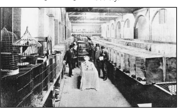
Poultry show on the skating rink in the Exhibition Building, Lower Macquarie Street, August 1900