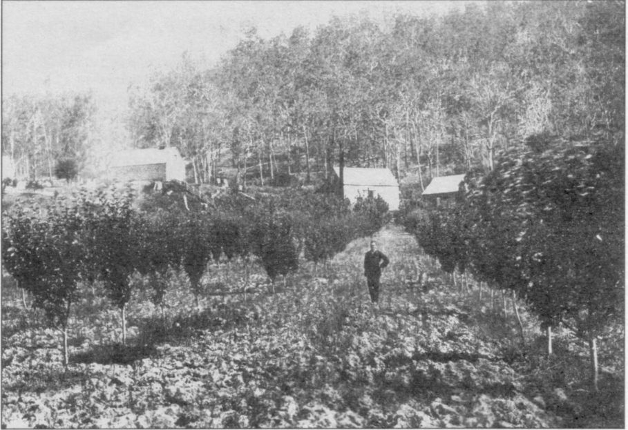
Glen Huon Orchard 1883