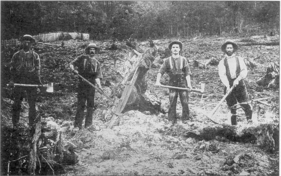
Land Clearing in the Huon before 1900