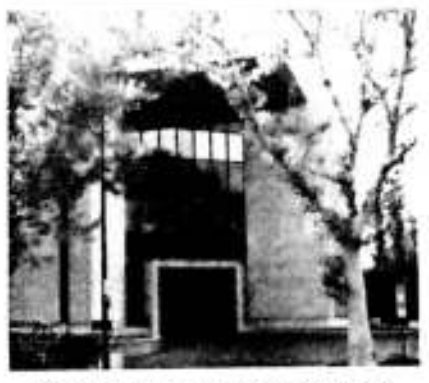
LDS Genealogical Library Salt Lake City